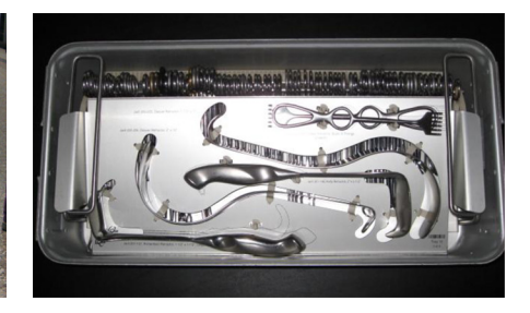
Sterilization Container Systems

Metalphoto® signage memorializes procedures and stays readable after cleaning, sterilization and other abuse.