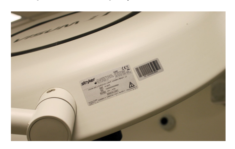
Asset Identification Labels

frustrations and health risks. Metalphoto is used for permanent medical/surgical device and procedure identification applications such as asset identification/UDI barcode labels, procedure identification/communication signs, sterilization container labels & systems, surgical device control panels and several others.