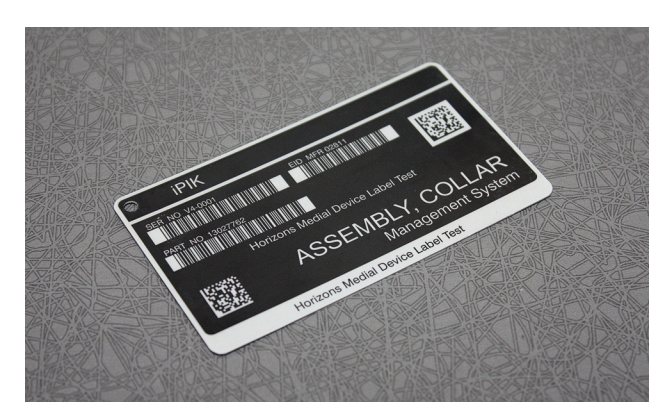
Images on Metalphoto are high-resolution, and legible, even after sterilization.

The Association for the Advancement of Medical Instrumentation (AAMI) published ST79 – the comprehensive guide to steam sterilization and sterility assurance in health care facilities in 2012. ST79 consolidates five AAMI steam sterilization standards into a single comprehensive guideline for all steam sterilization activities in healthcare facilities. The FDA requires all medical devices that must be sterilized to be validated to ST79 – Metalphoto now joins the list of materials tested to ST79 sterilization.